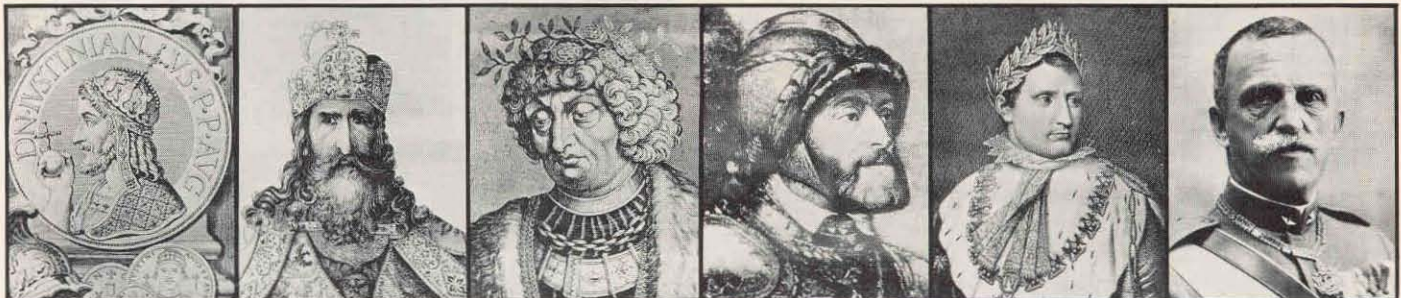
JUSTINIAN, author of "Imperial Restoration" of Roman Empire, 554 A.D.