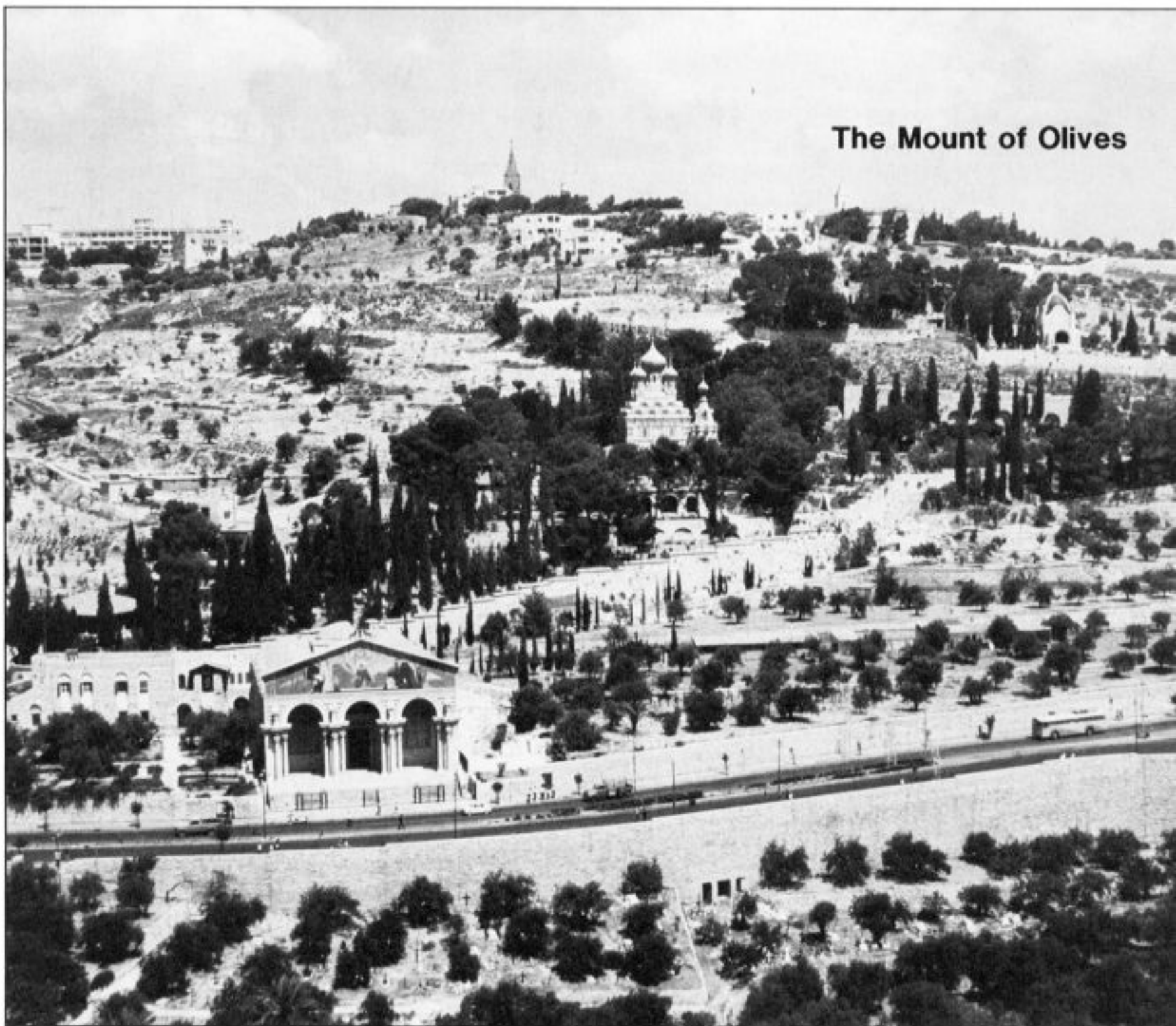
The Mount of Olives