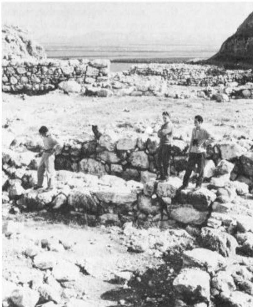
RUINS OF MEGIDDO —Remains of city structures, with Valley of Jezreel in the distance.

COMMENT: Jehoshaphat means “judgment of Yahweh” or “judgment of the Eternal.” The focal