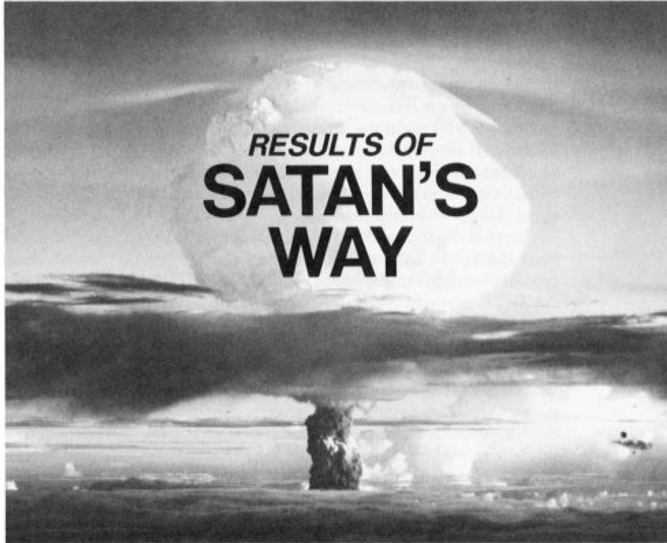
U.S. Air Force