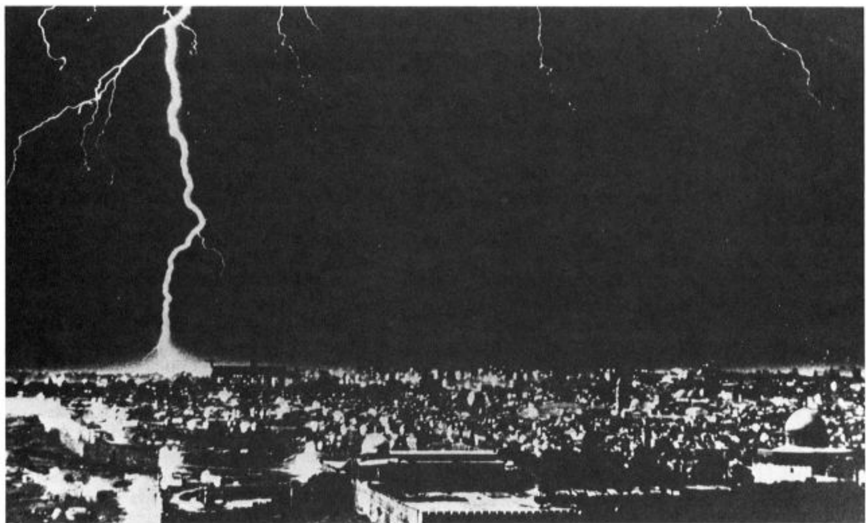
SATAN'S FALL —Jesus saw Satan fall from heaven "as lightning" (Luke 10:18). Rare photo shows a lightning bolt over Jerusalem, with the Temple Mount in the foreground.

COMMENT: Can you imagine angels becoming sinning angels? Yet that is what God reveals. And since sin is the transgression of God's Law, these angels transgressed—rebelled—against GOD'S LAW OF LOVE—the very foundation of God's government—God's way of life!