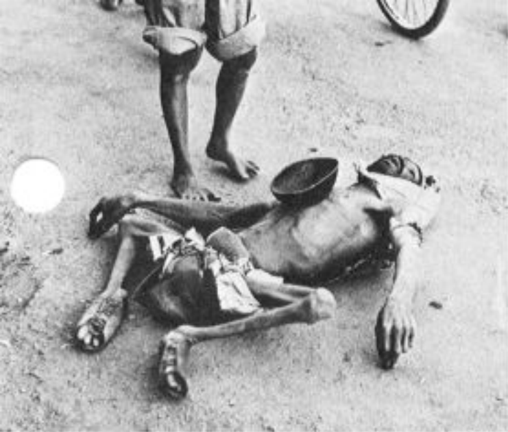
Deutsche Presse Agentur Gmb H