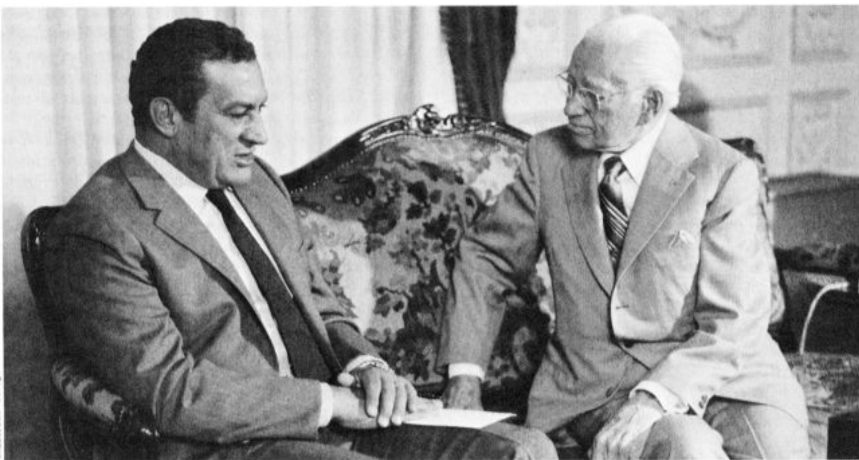
GOSPEL GOES TO WORLD LEADERS —As one “sent forth,” God’s modern-day apostle has talked with heads of state worldwide, proclaiming the good news of the coming Kingdom of God. Pastor General Herbert W. Armstrong (right) is shown with President Hosni Mubarak of Egypt.

compressed together as closely as if welded. This shows organized unity!