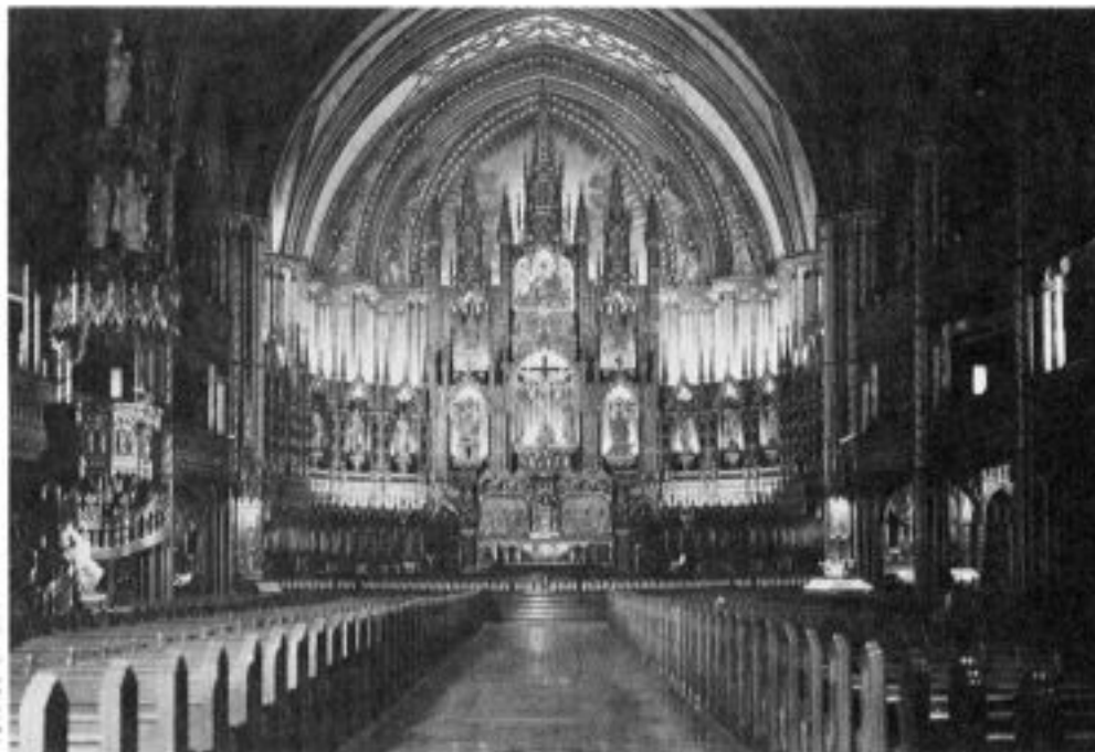
Province of Quebec Film Bureau

Remember that Satan, formerly the cherub