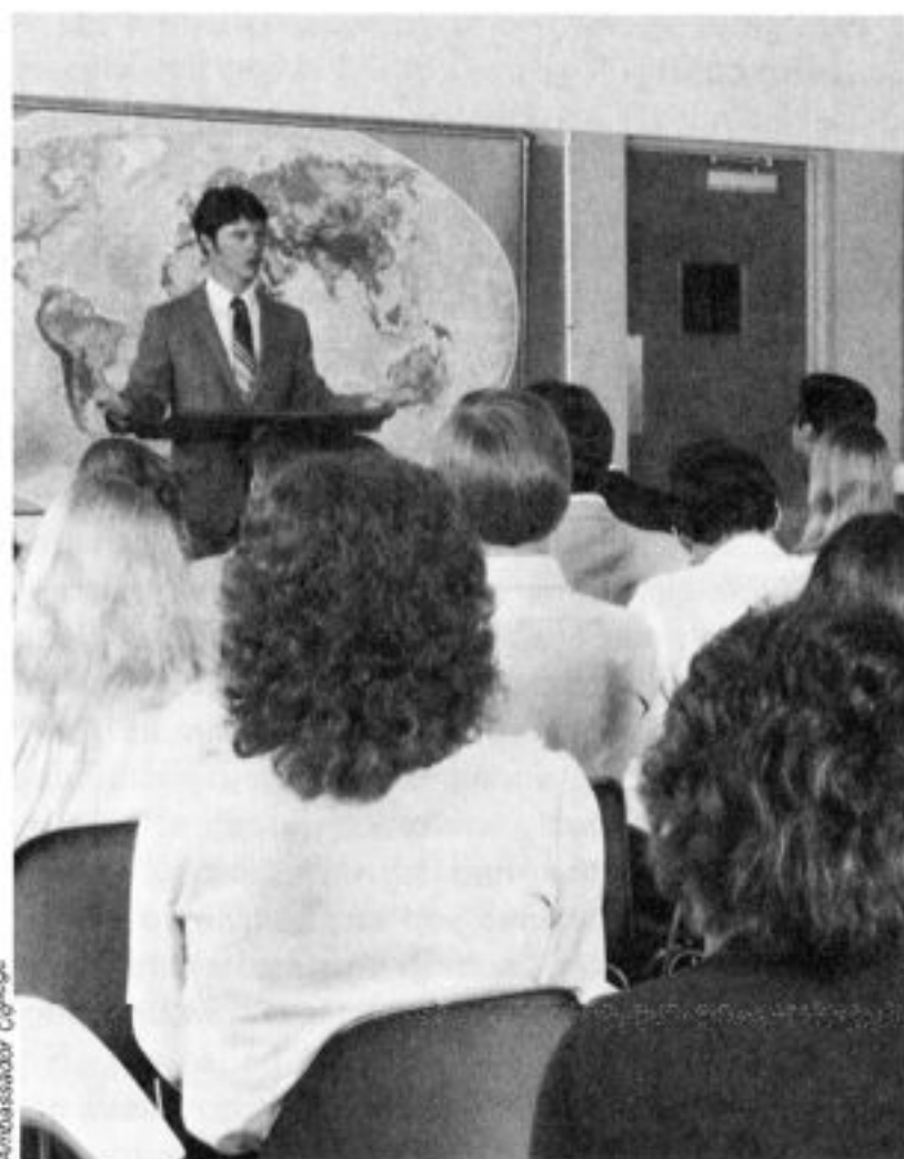
LEARNING TO RULE —The Christian life is like going to school to learn how to rule and teach.

Baptism and the laying on of hands of a minister of God for the receipt of the Holy Spirit also shows our recognition of, and submission to, the authority God has placed in the called and chosen ministers of His Church. And through the consequent begetting of God's Spirit, we become part of His govern-