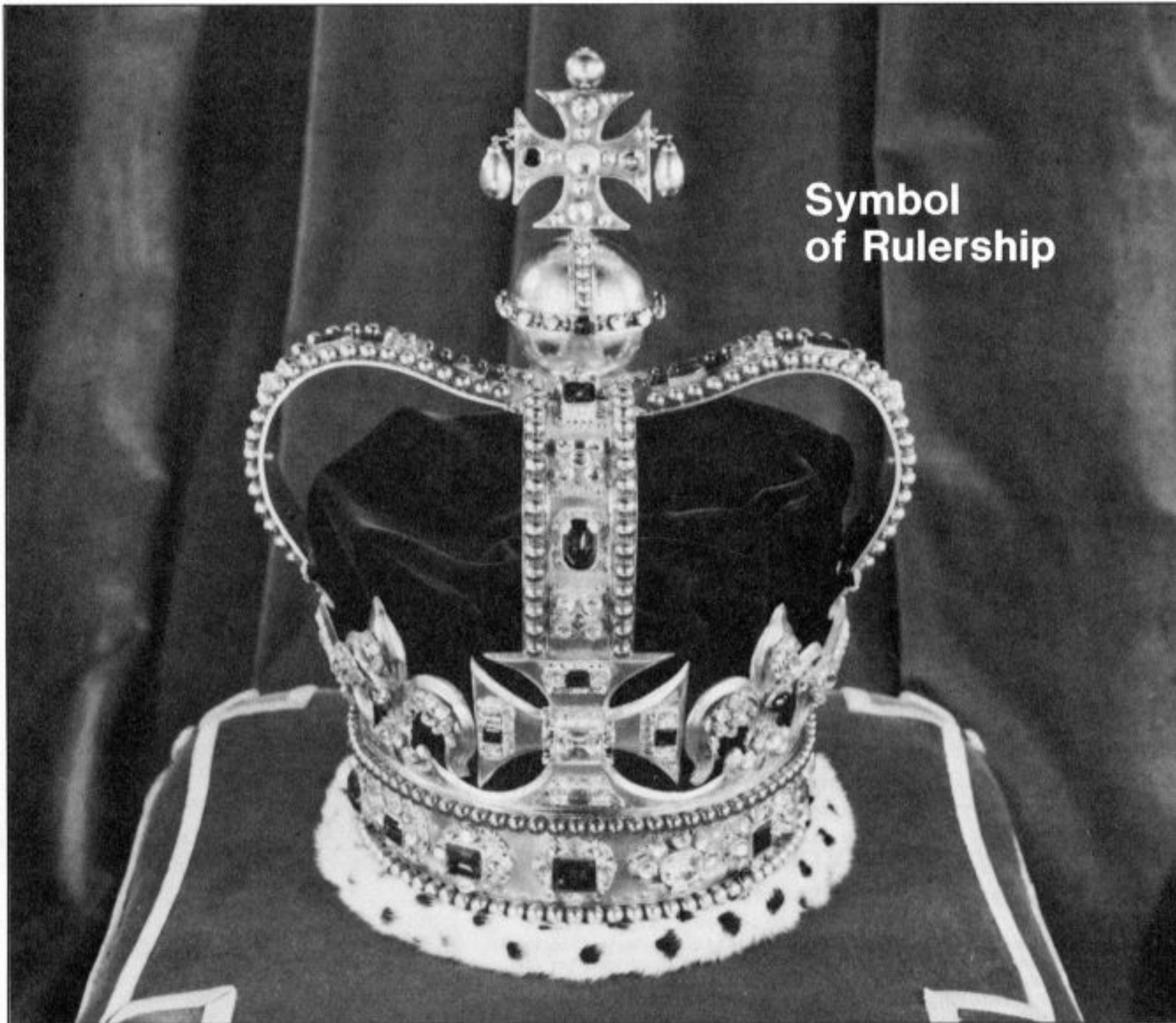
Symbol of Rulership