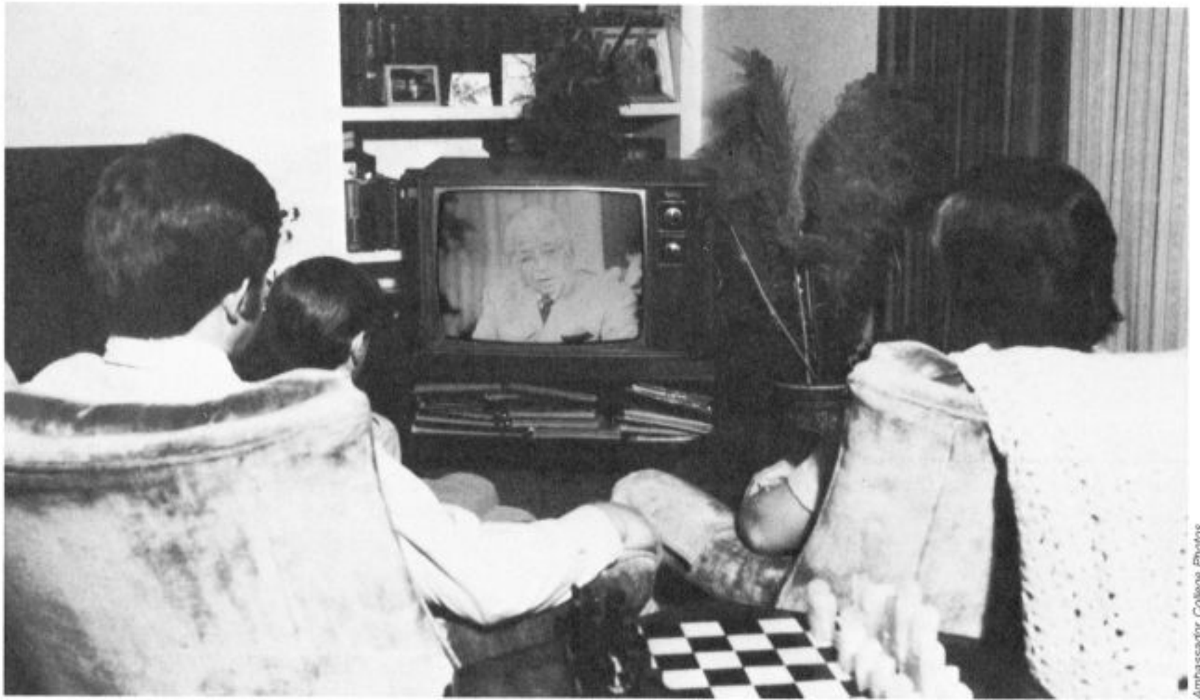
Ambassador College Photos