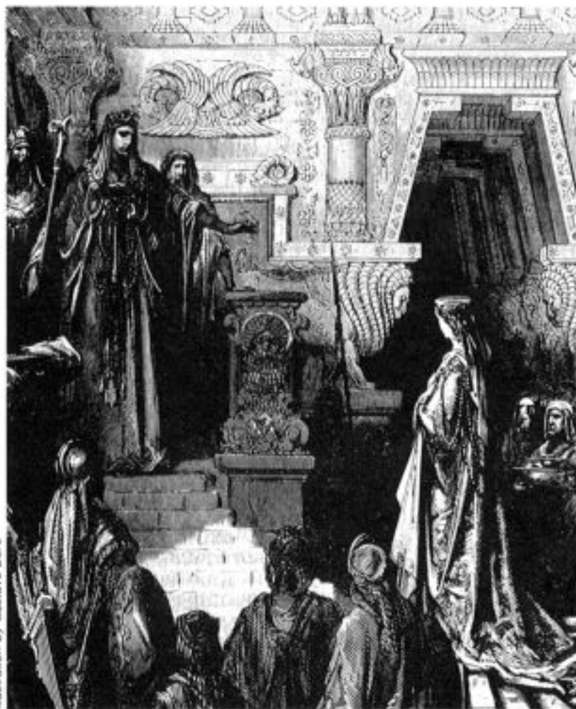
QUEEN OF SHEBA —Pictured here approaching King Solomon, the Queen of the South will have her opportunity for salvation after the Millennium.

Spirit-begotten Christians today. They will be taught God's Law, and will learn they are guilty of sin and deserving of the death penalty for all eternity as a result of their sins. They will learn of God's mercy, and that Christ paid the penalty for them, if they will accept His payment. The vast majority will undoubtedly repent.