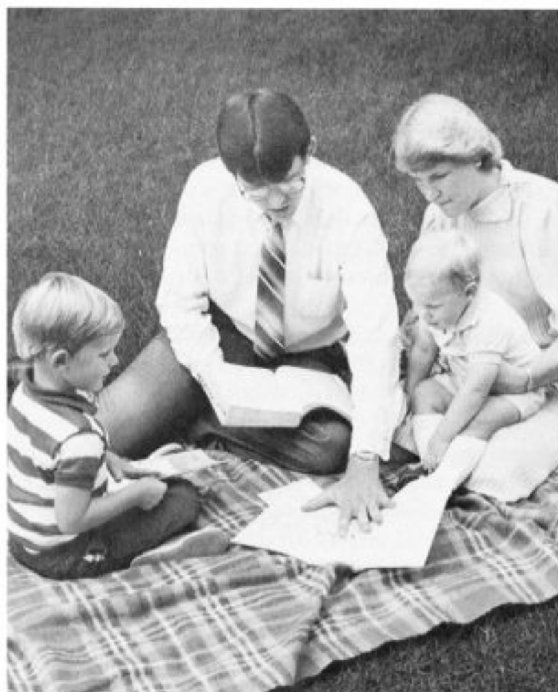
FAMILY BIBLE STUDY —The Sabbath is an excellent time to promote family togetherness by learning more about God, His great Law and the tremendous blessings He promises to those who obey Him.

COMMENT: The Sabbath is intended to free us