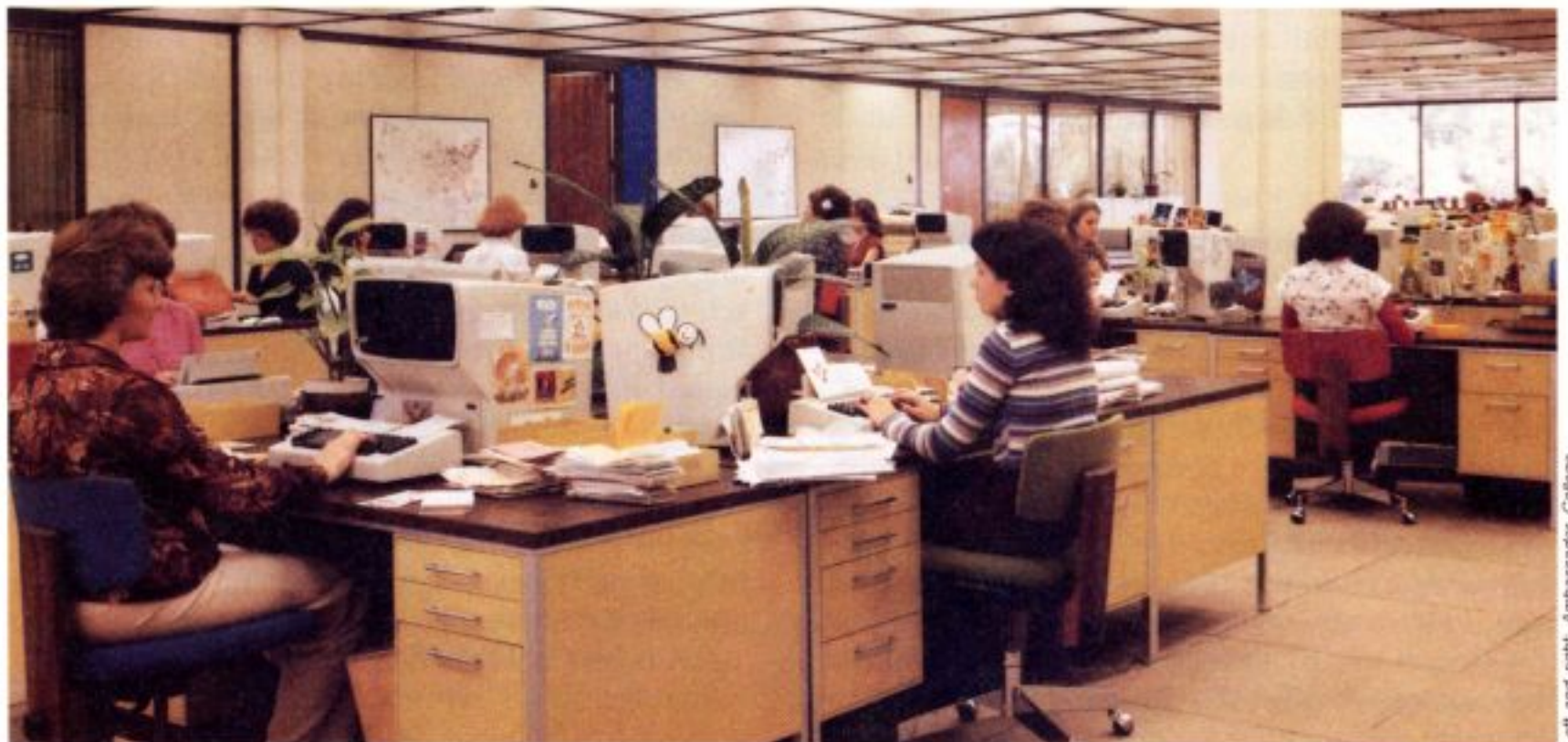
Left and right: Ambassador College