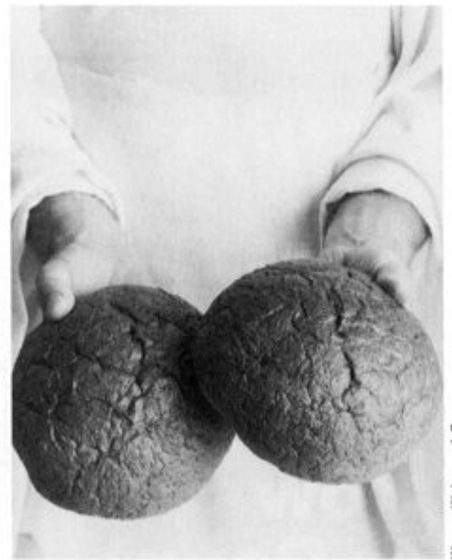
THE FIRST OF THE FIRSTFRUITS , picturing the risen Christ, was cut, prepared and waved before God on a Sunday during the Feast of Unleavened Bread. Fifty days later, on the day of Pentecost, two loaves of baked bread were waved, representing the firstfruits of the Old and New Testament periods.

Plan: God's people today are merely the firstfruits—the small first group to be offered salvation through Christ.