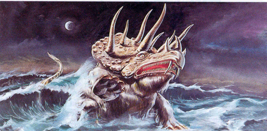
THE THIRD BEAST in Daniel's dream was followed by a fourth that was "dreadful and terrible" (Dan. 7).

civil government martyred millions who were declared "anathema from Christ" or "heretics."