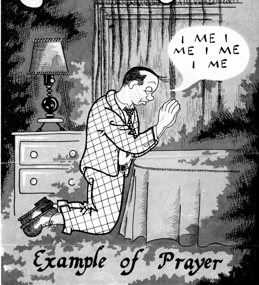
Example of Prayer