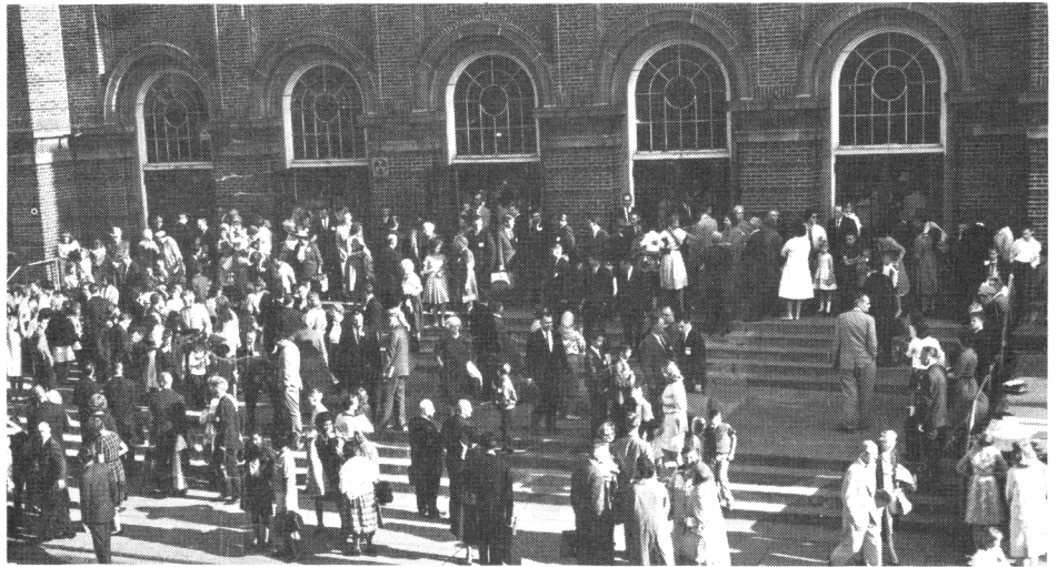
The massive Gary Memorial Auditorium engulfs the record Sabbath Day Congregation of 2,121 people for the Feast of Pentecost.