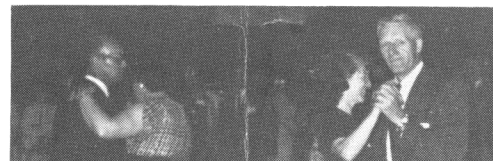
Do you recognize these couples? Honored by a special dance at the social, are the two longest married couples attending.