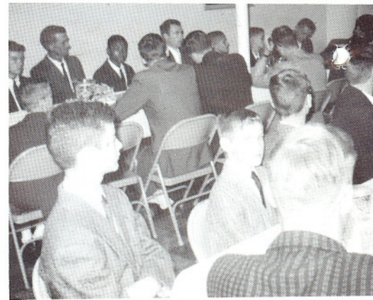
Fathers and Sons

The first father-son meeting of the Wichita Sunday Evening Spokesman Club was held Sunday, October 31. The young men who were able to attend the meeting were greatly impressed and many of them are eagerly awaiting the day when they will be able to join the club themselves.