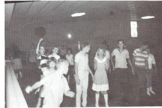
Roll on! Roll on!

Smiling faces September 5, marked another eventful day for the Wichita youth as they gathered at Skateland Roller Rink for a skating party. The skaters participated in a grand march, under the bar contest as well as special trio and couple skating. Many took home reminders of their experience in the traditional colors of black and blue — something they are sure to remember for some time. Whether a beginner or an "Old Pro" it was enjoyed by all!