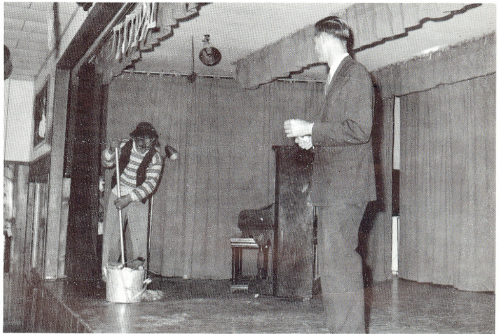
The show goes on.

A special vote of thanks is due the Denver church teen-agers for doing such an admirable job of decorating the hall.