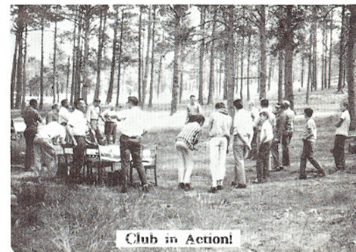
Club in Action!

One of the tests of leadership is the ability to recognize a problem before it becomes an emergency.