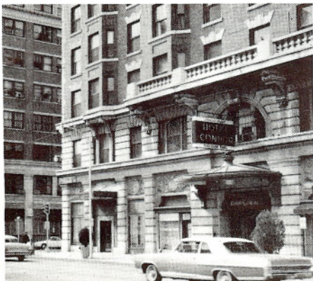
The Connor Hotel