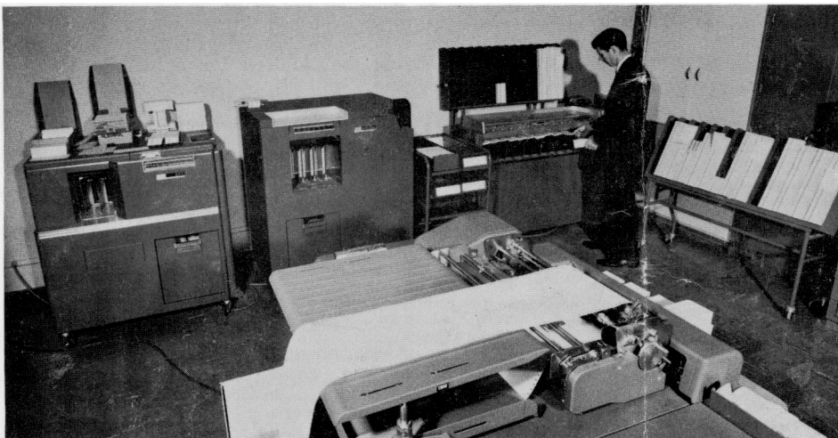
Streamlining through efficiency, speed, accuracy and multiplicity of purpose; these latest electronic additions to the Filing Department are condensing man-hours into electronic seconds. See these fantastic machines on your tour through Ambassador College Press.