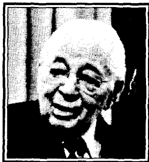
1980, writing in the Washington Star, described it this way:

Pogrom, however, may be the only word suitable for describing the ghastly attack on our Church by the attorney general. Conservative columnist James J. Kilpatrick, on March 25,