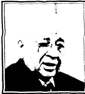
HERBERT W. ARMSTRONG

What brought a fast-advancing civilization to the very brink of such unbelievable—yet real ultimate catastrophe? Why the paradox? If the threat is too awesome for most to contemplate, so is the advancement and progress in