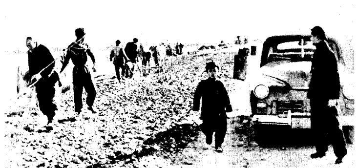
Here you see the primitive methods being employed by Red Chinese workmen as they resurface a road 70 miles from Peiping.