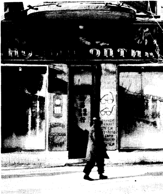
Left: Harbin, Manchuria. Notice the gray, grime-encrusted streets, and the Russian signs which share equal prominence with Chinese characters. Here you see a lone passerby, with up-turned collar because of the bitter, cold weather.

With these pictures, The PLAIN TRUTH scoops the world to bring its readers scenes from behind the Bamboo Curtain now penetrated by the Word of God.