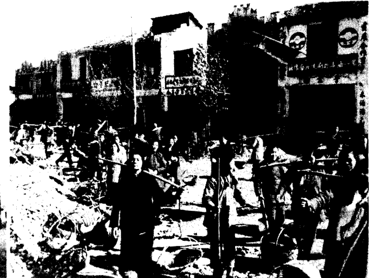
Volunteer workers, mostly women, are shown here carrying rocks and stones to be used in the construction of the approach to the Han River bridge at Hankow, China.